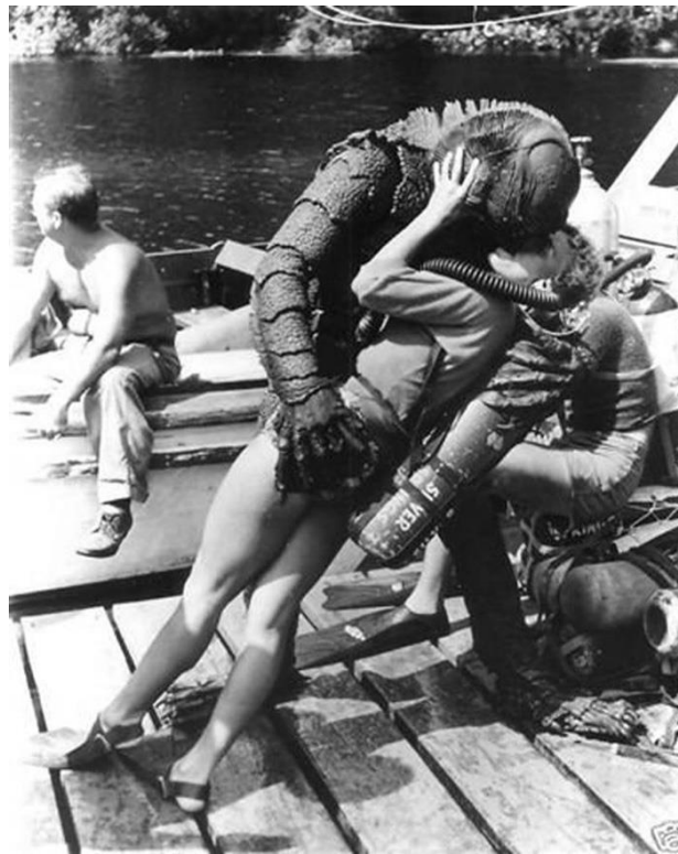
Photo from a favorite romantic movie- if you're fond of fish. I think they're just dating here but there might be wedding bells in the future.

We have talked about having a Zoom movie night but the details haven't been confirmed yet. We'll let you know when and if we get that program going.