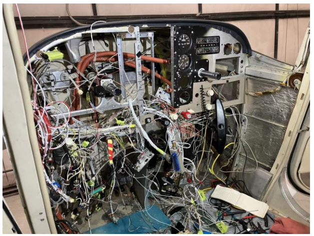
Things were looking pretty good at this point...

I spent more time tracing the existing wiring than I did actually installing the G5 wiring. Took out lots of nasty looking stuff and put in some much nicer looking stuff. When I talked to other mechanics about my experience, they always told me how many pounds of wire they had taken out of their airplanes doing the same thing.