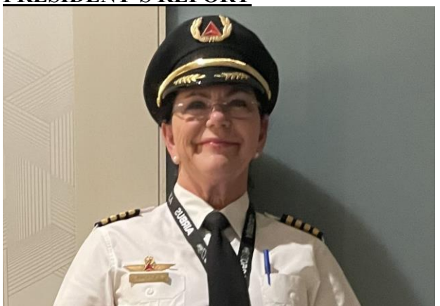
Greetings from Atlanta!

Summer is in full swing and judging by the weather I saw on the way from Los Angeles yesterday and the wildfires already lit up, it is going to be a doozy.