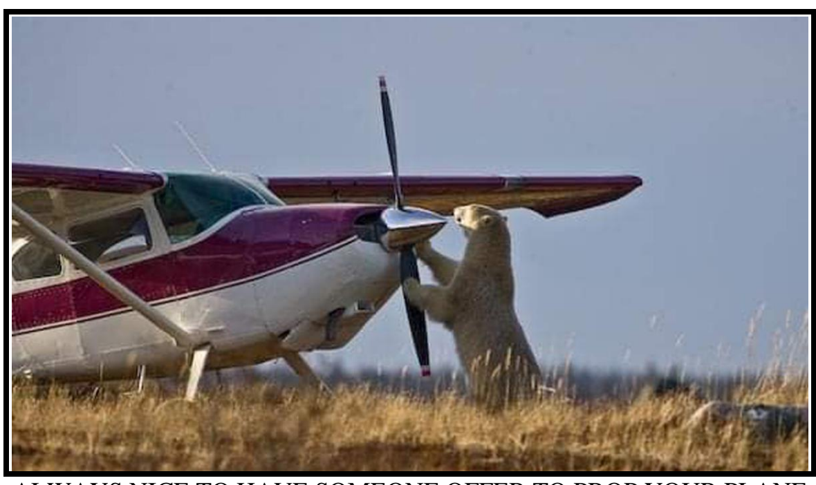
ALWAYS NICE TO HAVE SOMEONE OFFER TO PROP YOUR PLANE WHEN THE BATTERY DIES IN THE ALASKAN WILDERNESS. The pilot didn't notice the can opener in the bear's back pocket

Sonoma Skypark Airport 21870 Eighth Street East Sonoma, CA 95476 JULY 2024