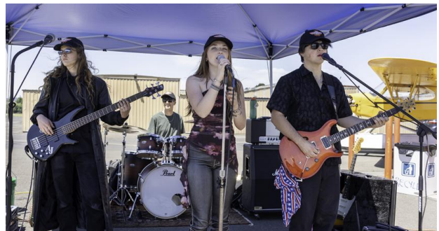
The Gas Monkey band rocking out

We have been talking about upgrading the barbecues to two new ones to replace the existing ones, and doing some painting and spiffing-up of the trailer and accessories. Let us know if you would like to help out on this project.