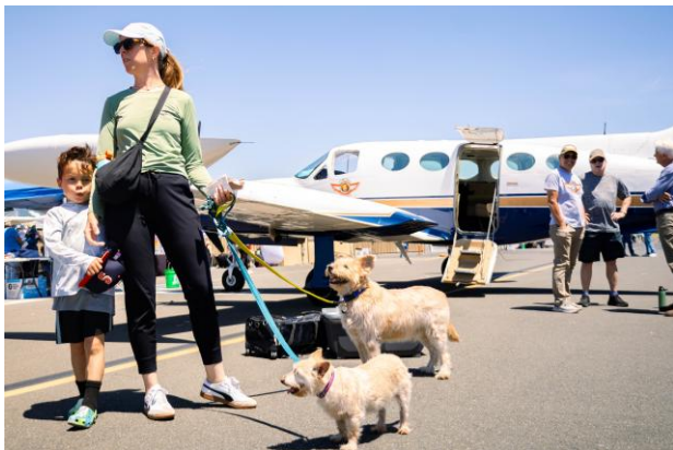
A couple of the many dogs in attendance

Chapter 1268 is also sending three young people to the Air Academy, the aviation summer camp at Oshkosh this year. Your generous contributions to the Chapter and your hamburger purchases throughout the year make all this possible. Thank you for helping pass on your passion for flying to the next generations.