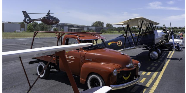
The REACH helicopter coming in for a landing

EAA Chapter 1268 to the Sonoma Valley community.