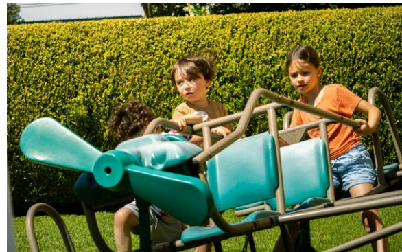
The airport flying teeter-totter saw continuous use during the day.